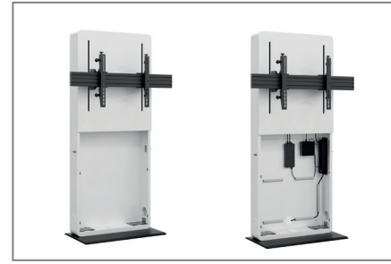
Accessories are protected inside the corpus