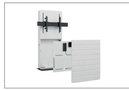
Easy assembly thanks to removable AV mounting plate