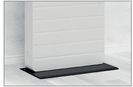
Tilt proof base plate